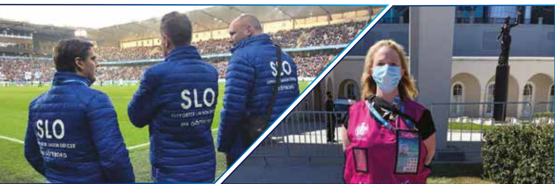
SLOs at work in their natural habitat

As mentioned in the executive summary, the SLO role first emerged in Germany