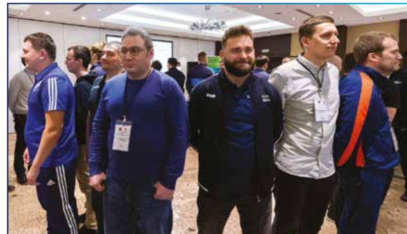
SLO training with the Russian SLOs

Preparatory meetings are held with the national association, SD Europe and the UEFA Academy to tailor the programme to the national context and the specific needs of the SLOs in that country. UEFA and SD Europe have a budget for expert speakers, while the national associations are responsible for covering the costs of the venue, catering and any overnight accommodation for participating SLOs. They also need to coordinate the session’s logistics with the UEFA Academy.