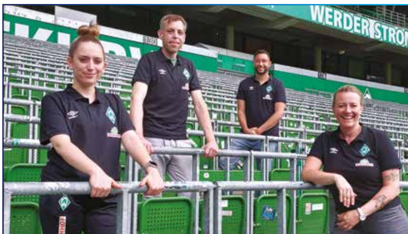
The SLO team at Werder Bremen

solutions with the ultimate goal of finding a compromise that is satisfactory to all the parties involved.”