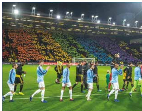
The mosaic tifo that the Proud Hornets arranged for a home game at Vicarage Road

get involved in the club, especially if they have unusual circumstances, which might make it difficult to go through the normal channels."