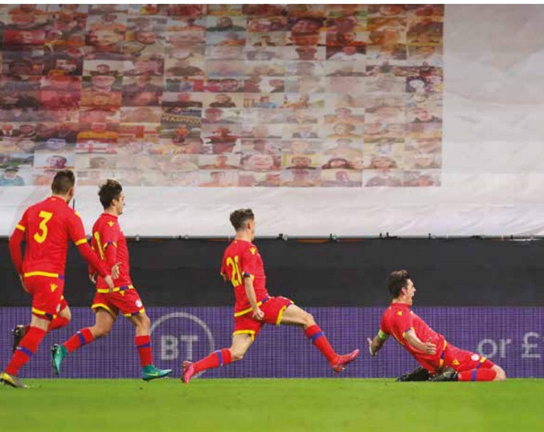
The Andorran under 21 national team celebrating a goal in front of a banner with digital fans during the pandemic