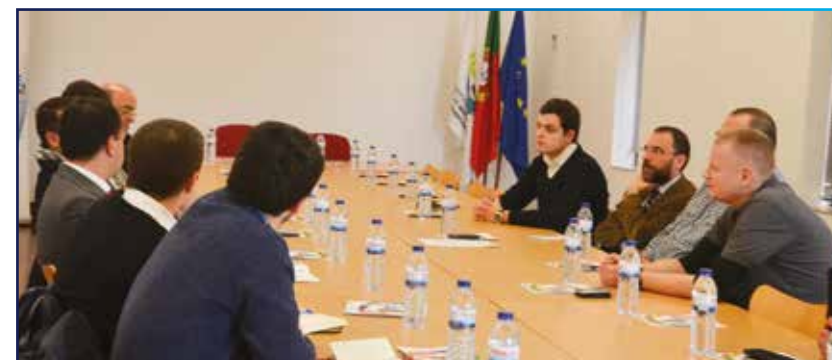
Bilateral meeting before the game between FC Porto and Eintracht Frankfurt

The first bilateral meeting took place in Nicosia in 2013 when Eintracht Frankfurt visited APOEL FC. It was born out of the idea of taking advantage of the presence of away team SLOs in European competitions to organise formal training sessions or informal Q&As with local stakeholders. For the home national association or league, bilateral meetings are a low-cost, environmentally friendly way of facilitating the exchange of information and best practice and thus increasing the knowledge of their SLOs, as they do not have to fly in any guest speakers from abroad. These meetings are easy, cheap and immensely popular with the local SLOs.