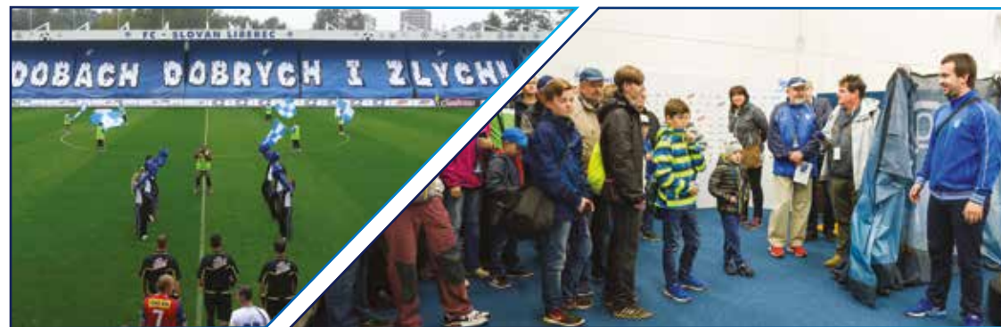
FC Slovan Liberec at their home ground, Stadion u Nisy